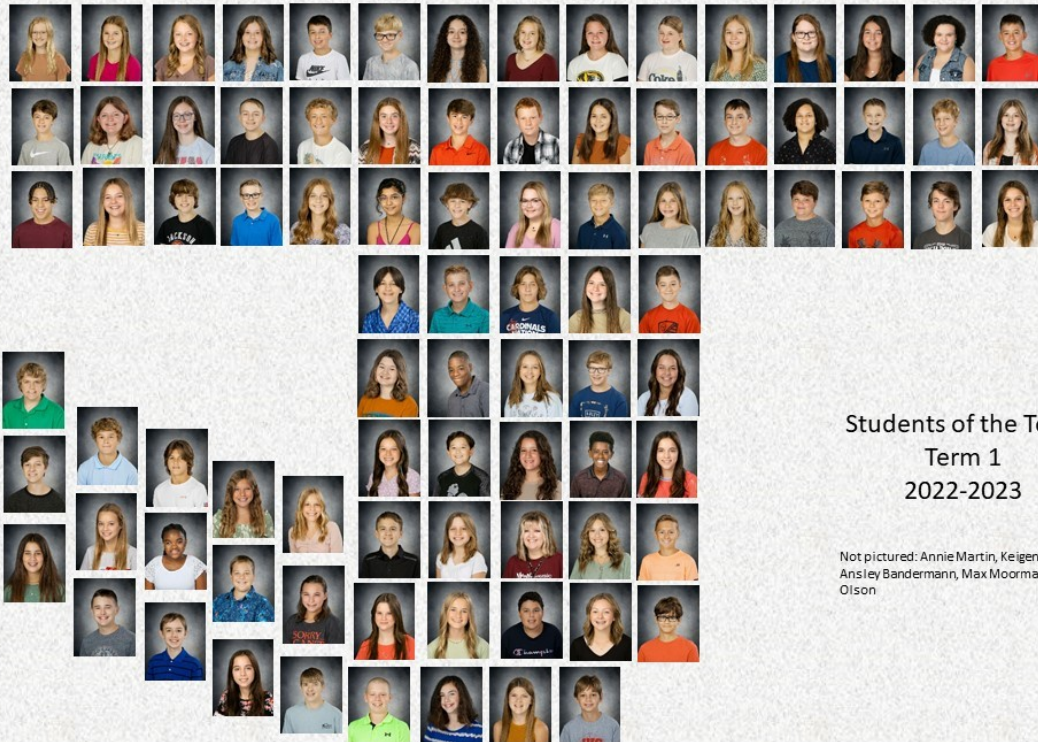
Students of the Term Term 1 2022-2023